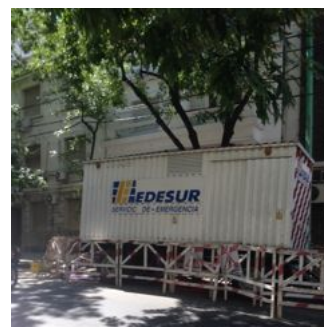
Auxiliary power generators. A common site because of power shortages this summer.