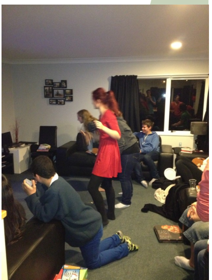
The youth playing some games at our house during a youth night.